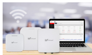
Secure Cloud Wi-Fi